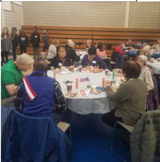
Highlights from the Martin Luther King Jr Senior Lunch & Bingo event on Monday January 15th. Thank you to our volunteers and friends who helped that day!