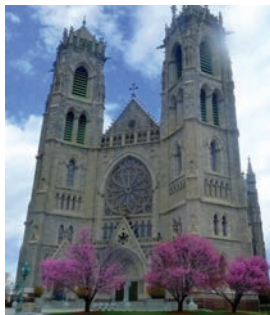
Sacred Heart Basilica Newark, New Jersey

Chrism Mass: Cardinal Joseph W. Tobin, C.Ss.R., the Archbishop of Newark, will be joined by his auxiliary bishops and dozens of priests from throughout the Archdiocese of Newark on Monday April 11 to celebrate the Chrism Mass, the second observance of Holy Week. Standing before clergy and parishioners, who fill the Sacred Heart Cathedral Basilica's pews, Cardinal Tobin will consecrate the Oil of the Sick, Oil of Catechumens and the Sacred Chrism for the year ahead. These holy oils were then distributed to the priests, who will use them for Baptism, the anointing of the sick and other sacraments at their parishes. Also during the Mass, the participating priests and bishops reaffirmed their commitment to Christ by renewing their priestly promises.